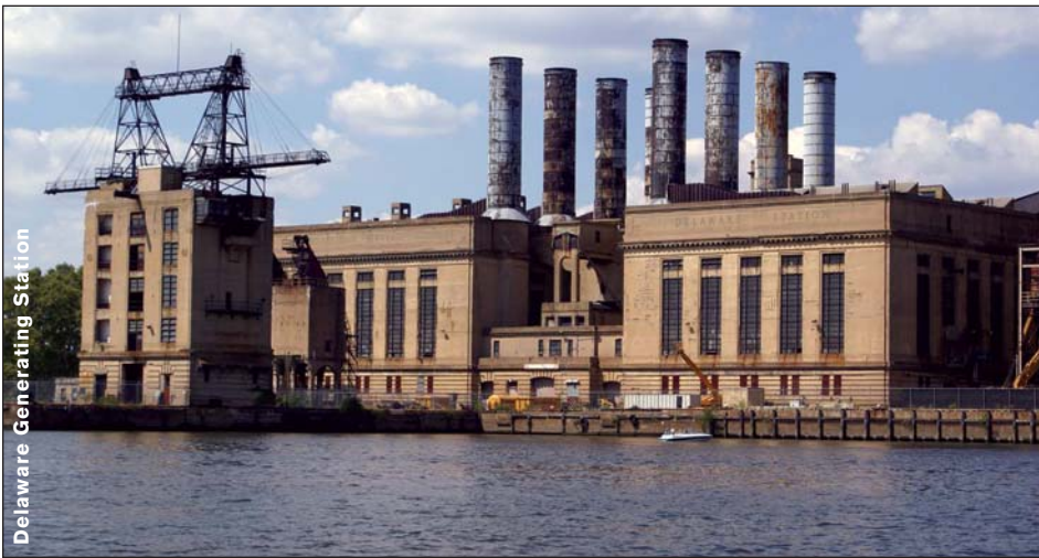
Delaware Generating Station